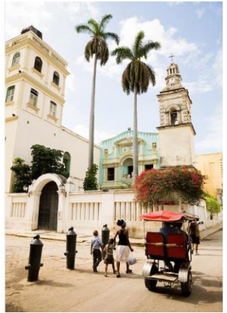
8 Days ● 16 Meals: 7 Breakfasts, 3 Lunches, 6 Dinners