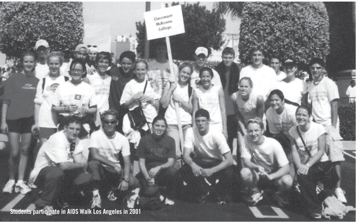
Students participate in AIDS Walk Los Angeles in 2001